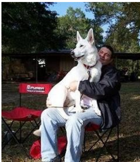
Missy & I watching the Herding events

Even with all of her wonderful accomplishments she is still just my "Princess", my most beloved, loyal & faithful friend. My Lovely Little Missy.