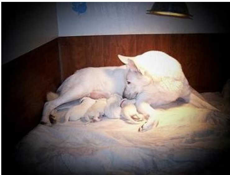
Missy and her 4 wonderful little babies at 1 day old

delivered 4 large beautiful, healthy puppies ranging in birth weight from 1 lb. 4 7/8 oz. to 1 lb. 2 1/8 oz. Everything this little girl does, she does Big!