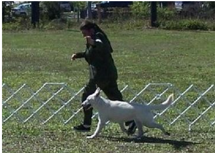
Missy's Champion Win at 9 1/2 months

I began puppy kindergarten and showing Missy in UKC Novice Puppy classes and she did very well taking home several Best Novice Puppy wins. When she turned 6 months old her show career took off like a shot with Missy taking home many of the the Best of Breed wins and placing in at least the top three spots in Group. I couldn't believe it, this little puppy was on a roll! She easily finished her Championship at the tender age of 9 1/2 months. She loves showing and prances around the ring with movement that screams "Look at Me!" with the attitude to match, she manages capture the attention of almost every judge we have had the pleasure of showing under. Living up to her name - Surefire Lil' Miss "Tasz" of FS, she is a little whirlwind in the show ring.