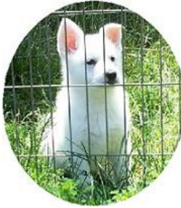
Missy 8 weeks old at SureFire Shepherds

I began puppy kindergarten and showing Missy in UKC Novice Puppy classes and she did very well taking home several Best Novice Puppy wins. When she turned 6 months old her show career took off like a shot with Missy taking home many of the the Best of Breed wins and placing in at least the top three spots in Group. I couldn't believe it, this little puppy was on a roll! She easily finished her Championship at the tender age of 9 1/2 months. She loves showing and prances around the ring with movement that screams "Look at Me!" with the attitude to match, she manages capture the attention of almost every judge we have had the pleasure of showing under. Living up to her name - Surefire Lil' Miss "Tasz" of FS, she is a little whirlwind in the show ring.