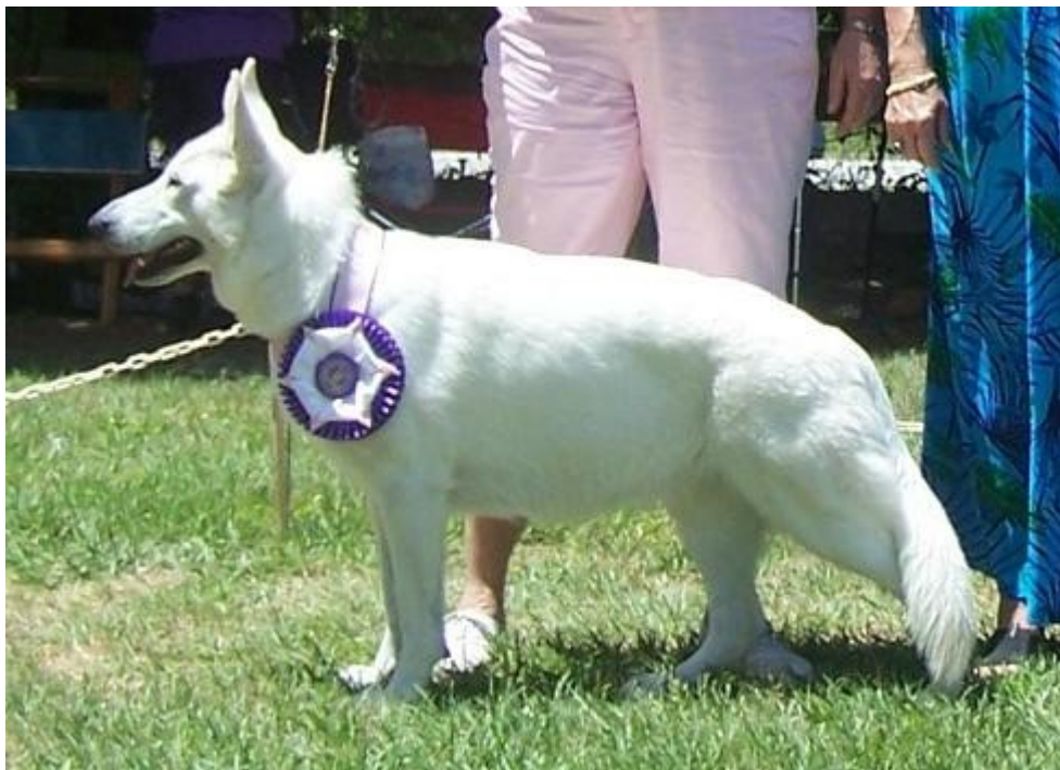
Archer, FL. Missy wins the Best in Multi Breed Show

Missy continued showing in conformation throughout 2007 earning multiple Best of Breed and Group wins. She managed to earn enough points to stay ahead, gaining enough points to not only reach the Top Ten ranking, but to hold the #1 position for the entire year. What a great feat, there are so many really beautiful White Shepherds that compete for Top Ten ranking throughout the year. In April of 2007 Missy had the honor of winning Best in Multi Breed Show, I had wished for this magnificent win for her and there are no words to express how I felt that glorious day! In May of 2007 she took the honorable win of Reserve Best in Multi Breed Show in Perry, GA. Missy finished out 2007 as the #1 Ranking White Shepherd for UKC.